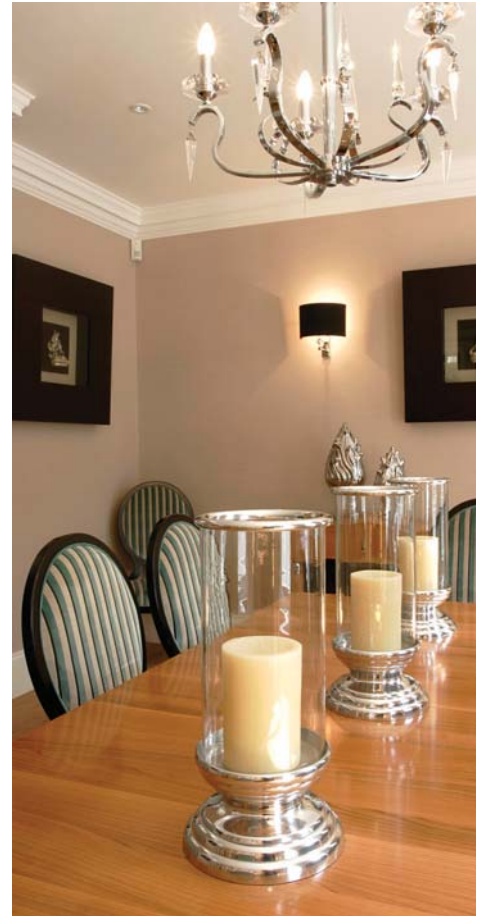
The black and chrome accents really make themselves felt in the dining room