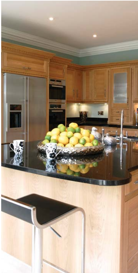
The American oak Stoneham kitchen