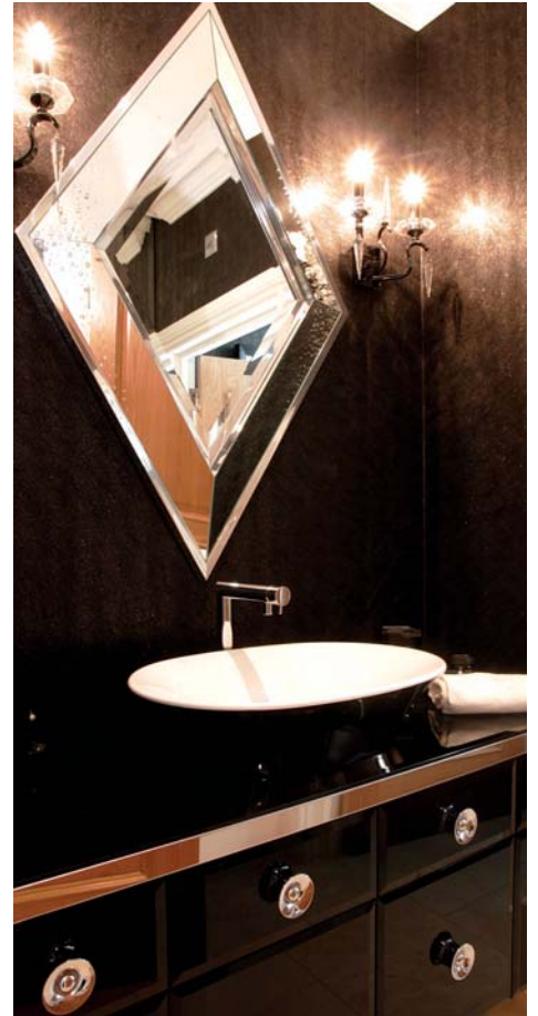
Above: Black pearlescent wallpaper is definitely a unique touch!