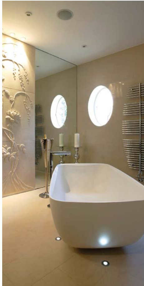
The wall carving dramatises the en-suite