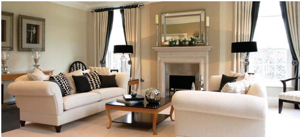
Top: The guest bedroom Above: The comfortable drawing room Below: The stunning indoor swimming pool